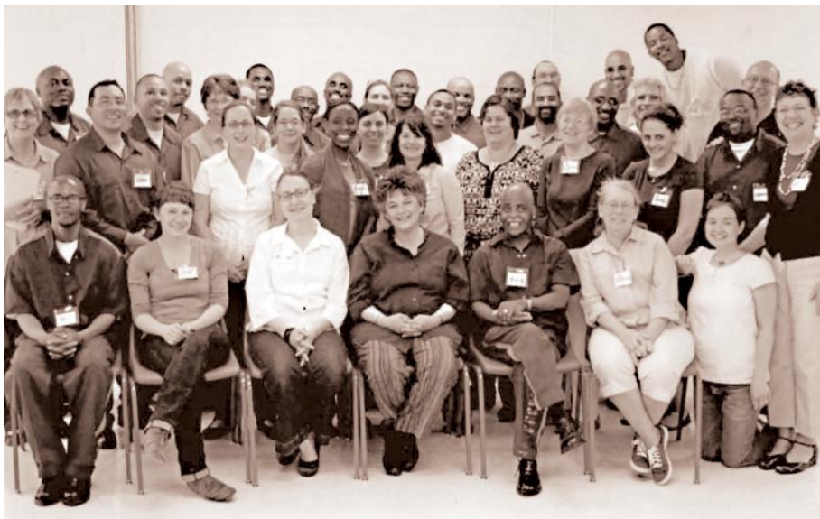
Inside-Out National Instructor Training Institute #19, held in Michigan, through the collaboration of Ryan Correctional Facility and the University of Michigan - Dearborn. This was the first national training held regionally in the history of the program.

After completing the Detroit training in May, I am both excited and overwhelmed by the prospect of teaching a class at Toledo Correctional Institution (ToCI) in the Spring 2012 semester. For me, the most powerful part of the training was the time we spent with the Theory Group (Inside-Out alumni) at Ryan Correctional. Not only were they our mentors and coaches as we struggled to put together coherent and engaging group activities, but their excitement about learning, their mastery of the readings, and their enthusiasm in participating in icebreakers and group activities was really inspiring.