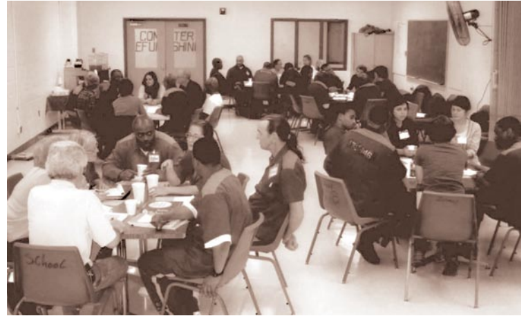
As part of the training, small groups worked together (as seen here) on developing an original curriculum, booklist, and activity for an Inside-Out class.